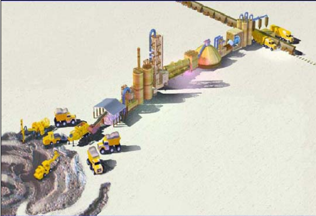
Figure 1: Snapshot of cement sector operations.