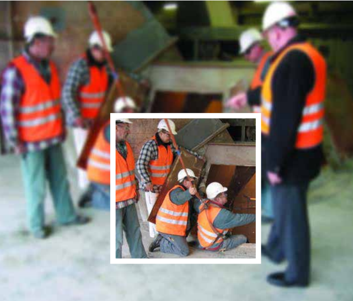
Safety training on the procedures for working in confined areas at Jura Cement, Wildegg facility.