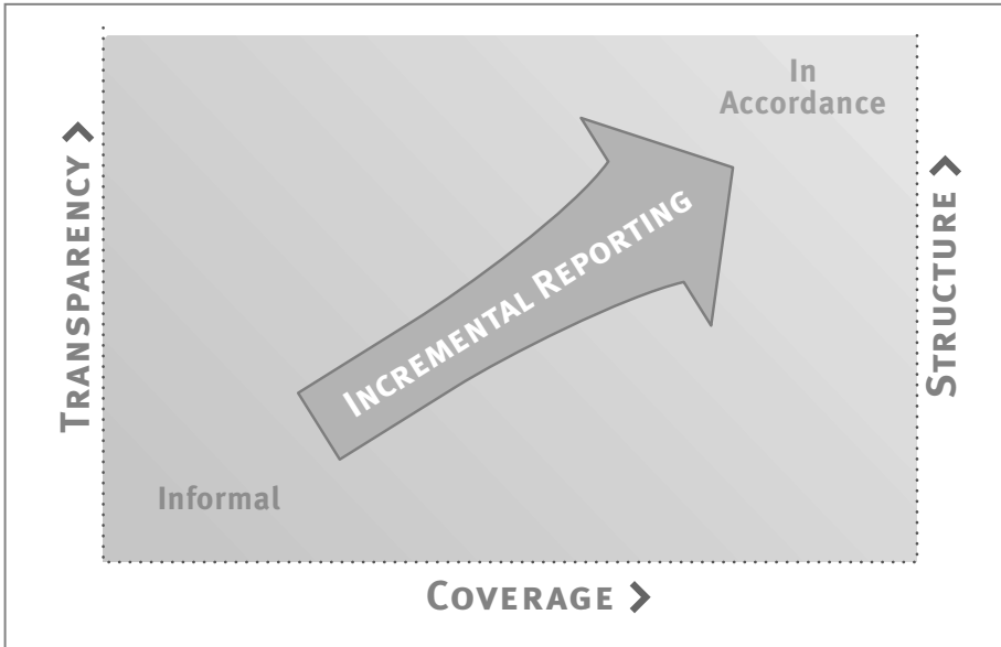
Figure 2. Options for Reporting

In sum, aware of the wide spectrum of reporter experience and capabilities, GRI enables reporters to select an approach that is suitable to their individual organisations. With time and practice, organisations at any point along this spectrum can move gradually toward comprehensive reporting built on both the principles and content of the GRI framework. Similarly, GRI will continue to benefit from the experiences of reporting organisations and report users as it strives to continually improve the Guidelines .